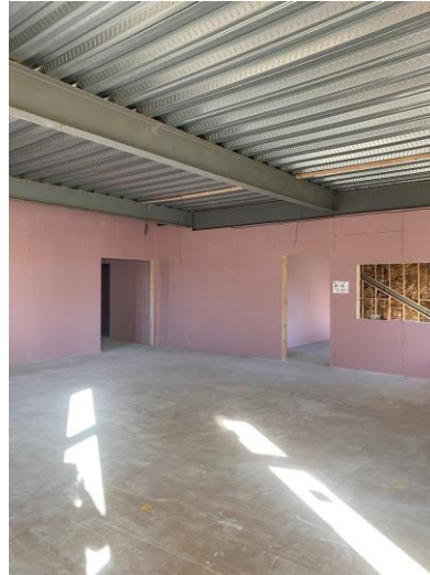
Groundfloor dining room now with plasterboard in place. This will be a great space to feed lots of hungry girls!