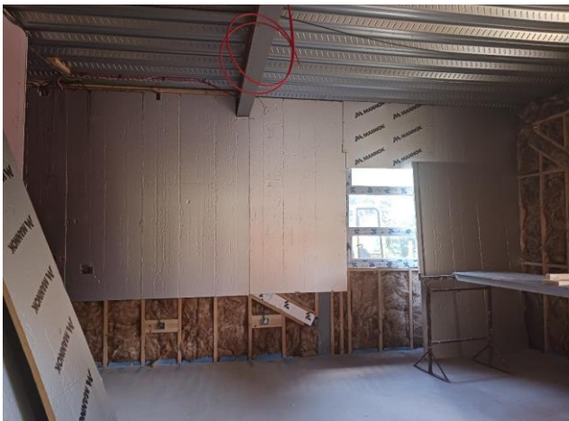
Inside of the kitchen - 6 inches of rockwool insulation now in place which is being covered by 15mm fireline plasterboard.