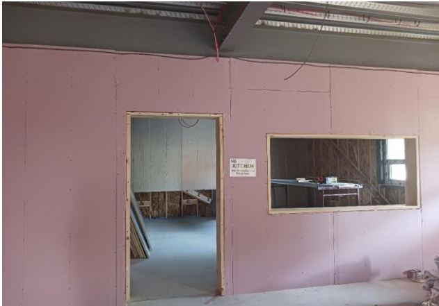
Outside of the kitchen. Door and serving hatch shown.

Progress continues at the Birk Crag Centre. The first floor is now structurally complete. On the ground floor 1 st fix electrics are mainly complete and insulation has started.