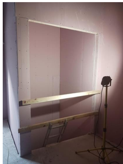
The lift shaft is now boarded out and ready for the lift connecting all floors to be installed.